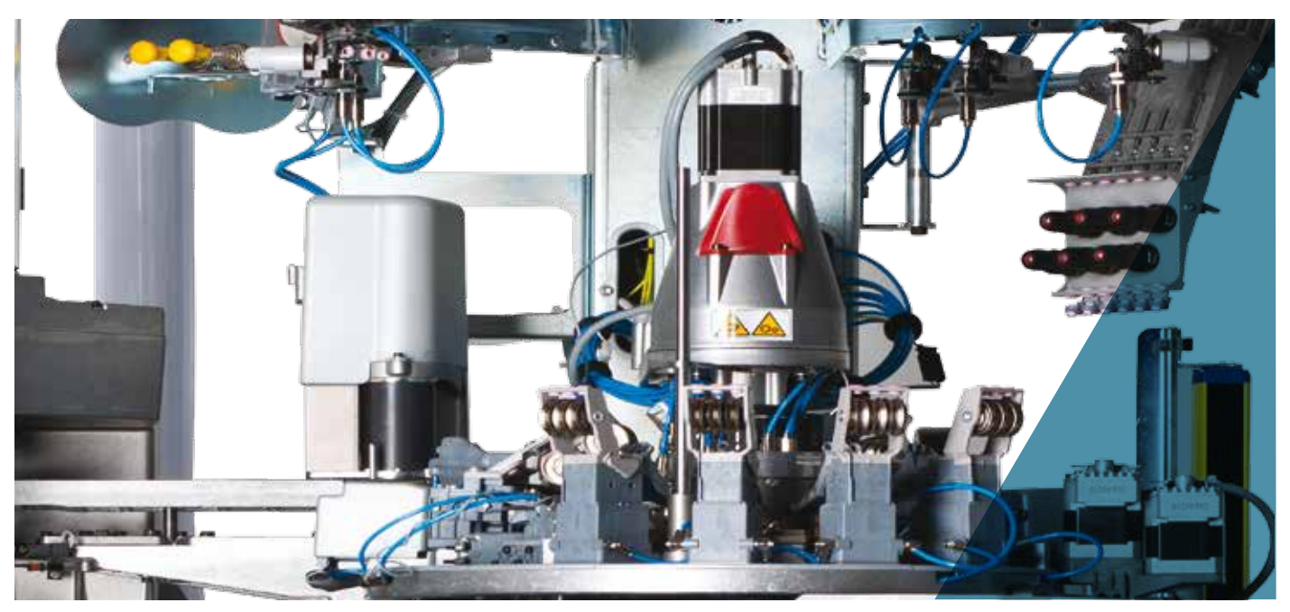
All images in this brochure are indicative and not binding.