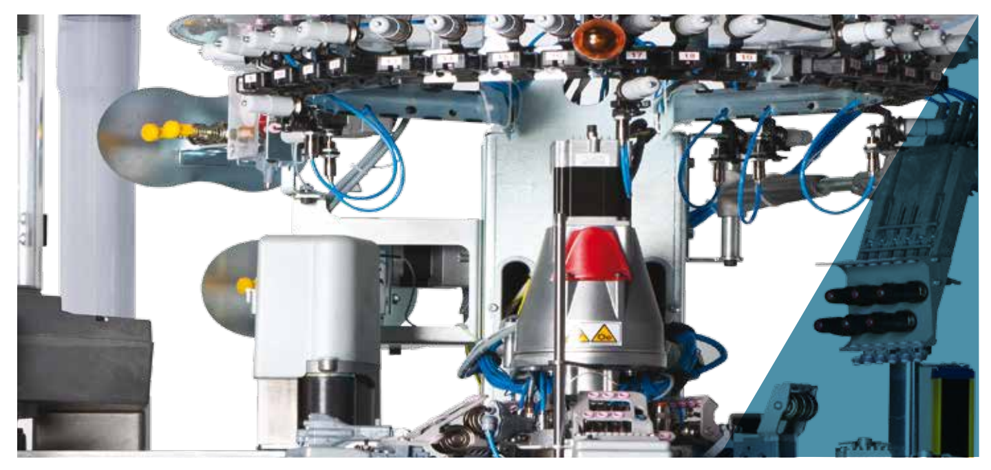
All images in this brochure are indicative and not binding.