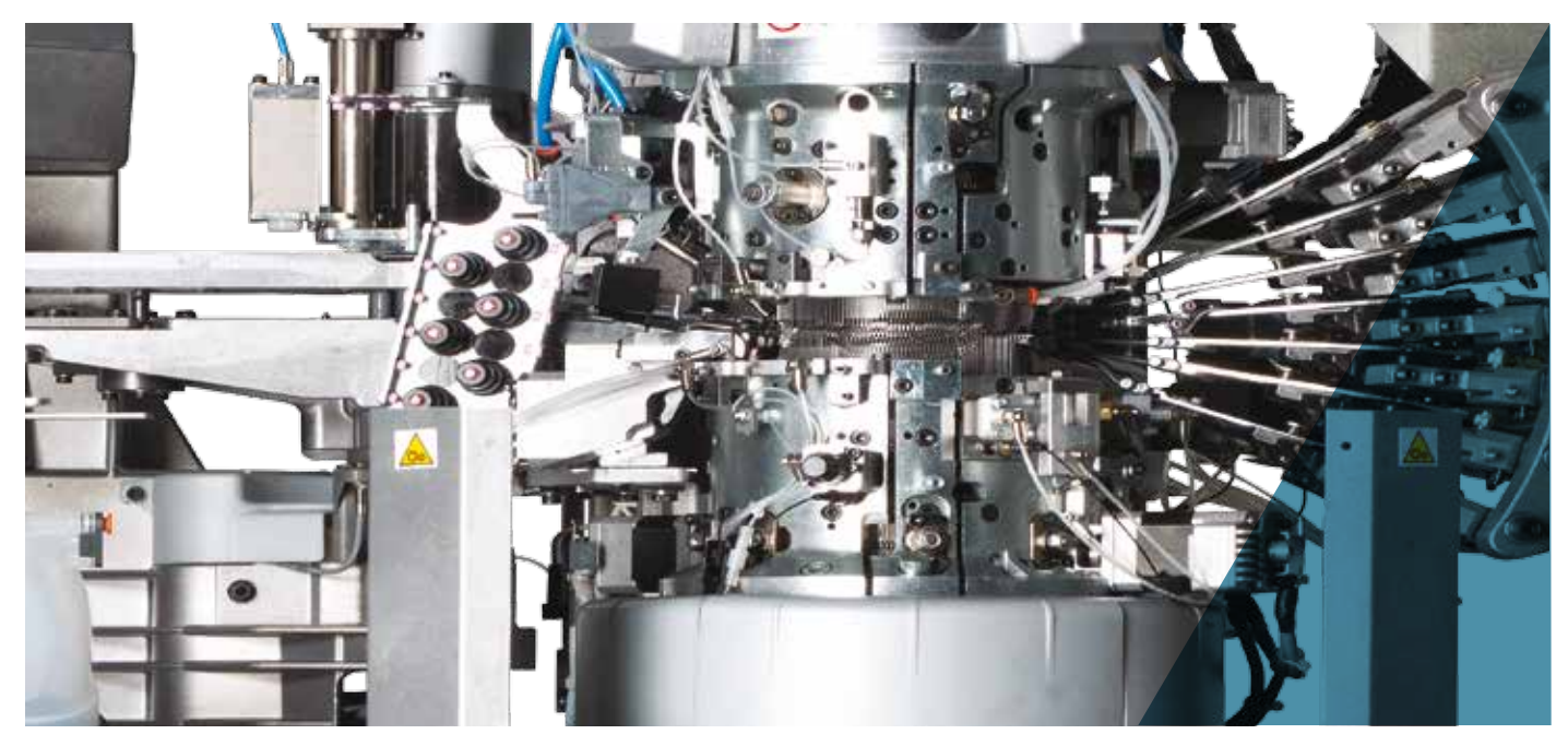
All images in this brochure are indicative and not binding.